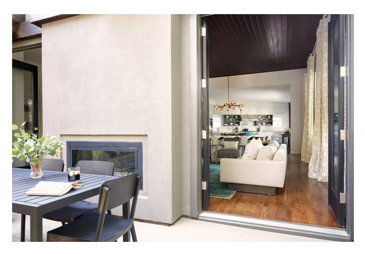
With the doors open, the two spaces become one.