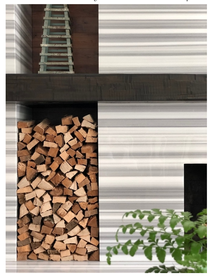
Exposed firewood warms the contemporary fireplace.