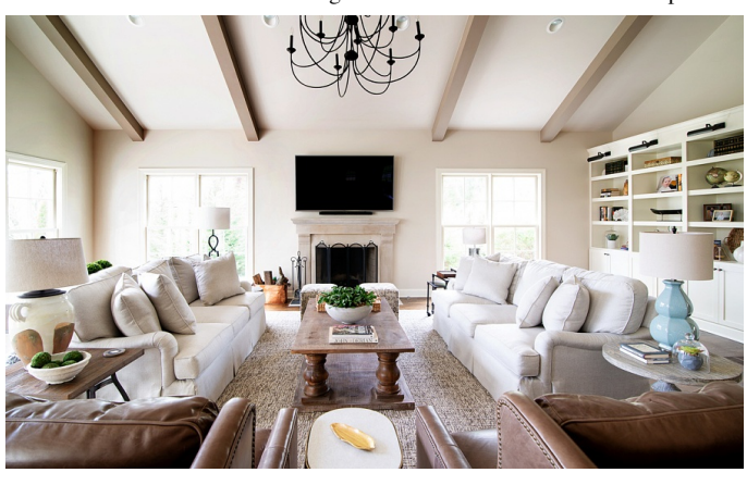
The beautiful ceiling beams are Derek's favorite part of the design, and we must agree!