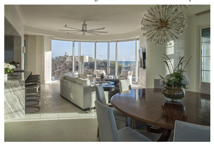
The kitchen is centrally located in the home and opens to the dining room and two adjacent patio spaces.