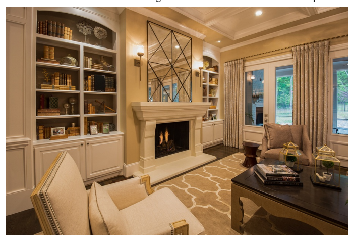
Custom built-ins and a stately mantle contribute to the design.