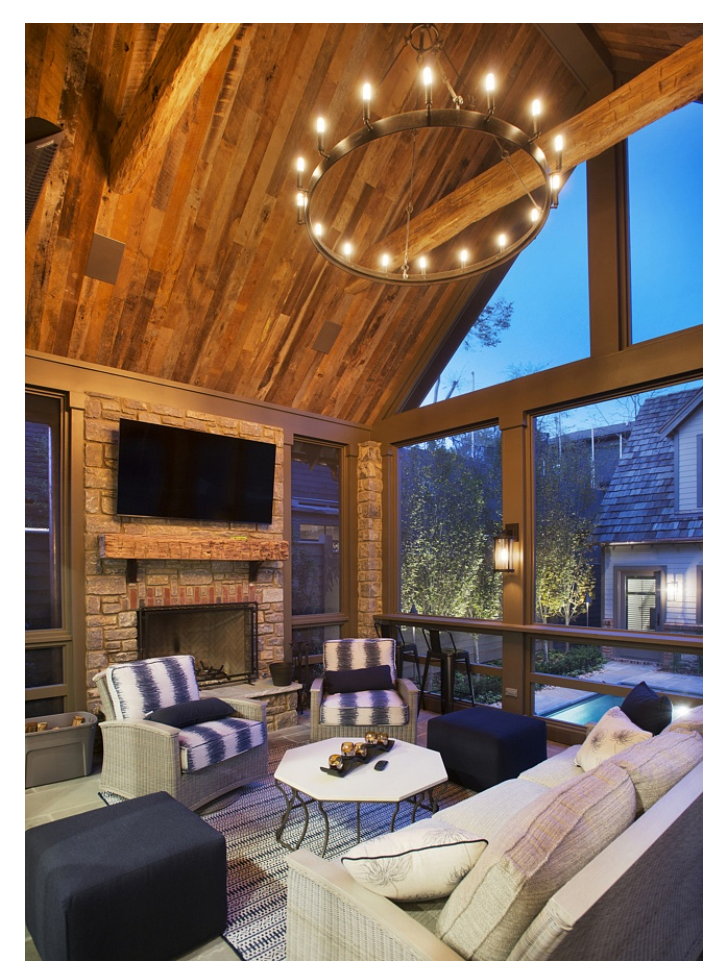
Woodstock Vintage Lumber supplied all of the screened porch ceiling and beams.