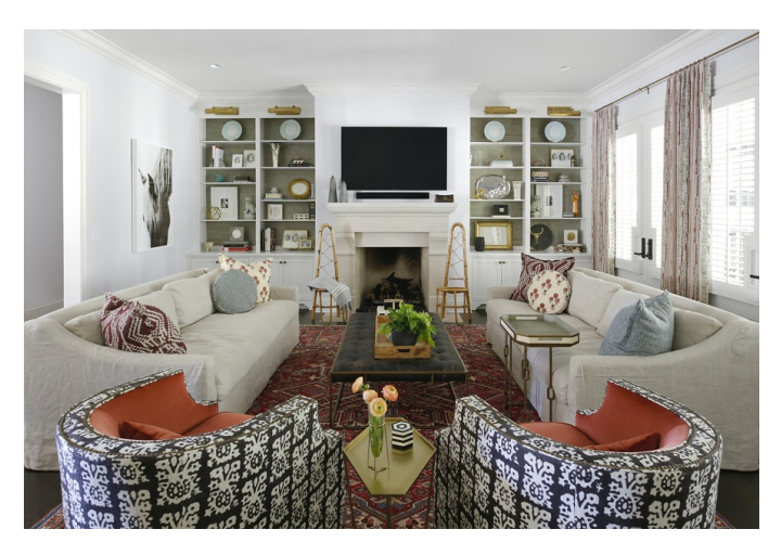
Patterns and colors in the fabric and accessories bring personality to the space. Image: Paige Rumore Photography

"The dyed grasscloth wallpaper behind the shelving adds unexpected texture and color," Kimberly explains. Image: Paige Rumore Photography