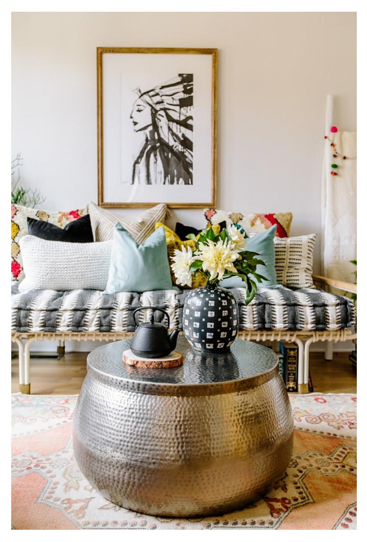
Art and decor bring personality into this space. Image: Abby Coyle

table might be," Karrie tells us. Image: Abby Coyle