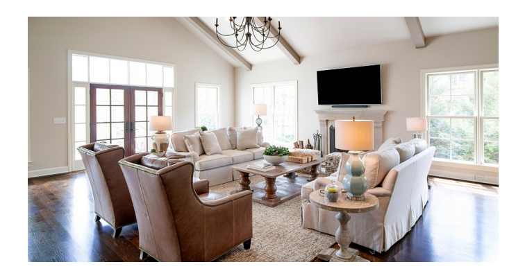
The functionality of the living space came first.